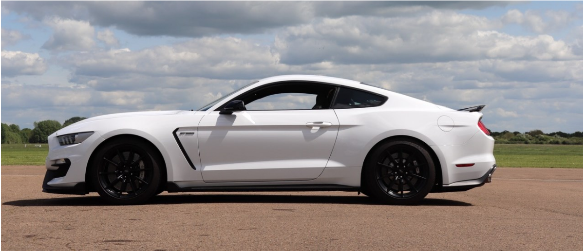
2016 Shelby GT350 Sold