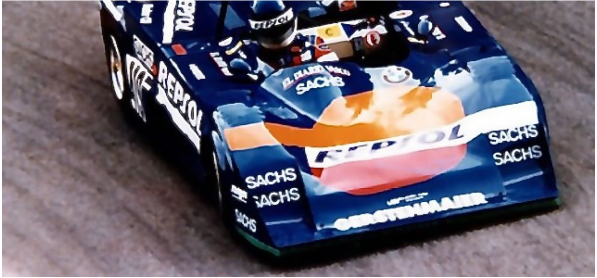
1979 Lola T298 BMW