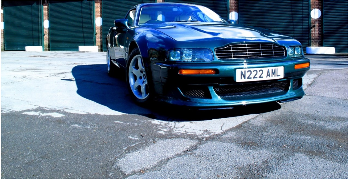
1996 Aston Martin Vantage V550