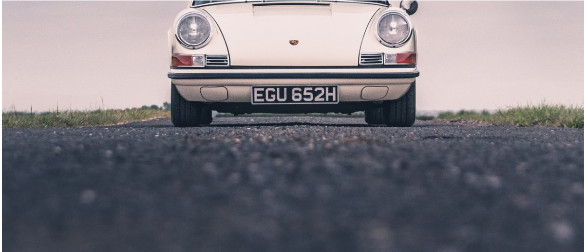
1970 Porsche 911E 2.2 MFI